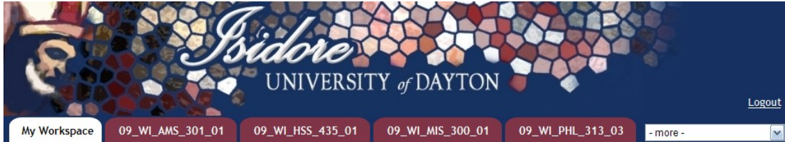
Figure 1: Click on the course title

Note: Course sites are not viewable to students in most cases until 2 days before the term is to begin.